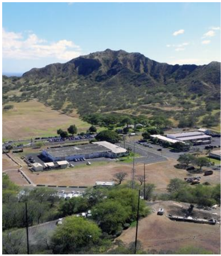
Continuing towards the right, the view of the floor of the crater, leading up to the summit.