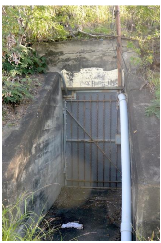
The Ewa entrance to Huling Tunnel, from the access road.

(Continued from page 6) walked or rode through the Kahala Tunnel to view the inside of the crater, and to make the hour hike to the summit. Improvements were made to the trail, the parking lot and restroom facility.